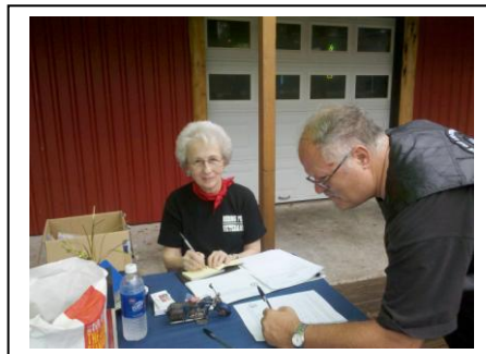
Ev Ison Signs In

Because of these men and women, the unit is able to continue its programs to support veterans, their families and active military. They never lost sight as to the reason behind our fundraising endeavor. A big thank you is given to all of the establishments and individuals who