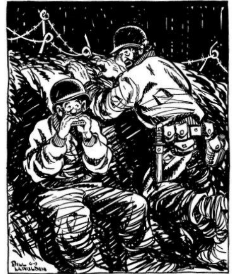
"Th' krauts ain't followin' ya so good on 'Lili Marlene' tonight, Joe. Ya think maybe somethin' happened to their tenor?"

Patricia's Light Infantry. Thus, "Lili Marlene" evolved from a minor German poem to an international song hit.