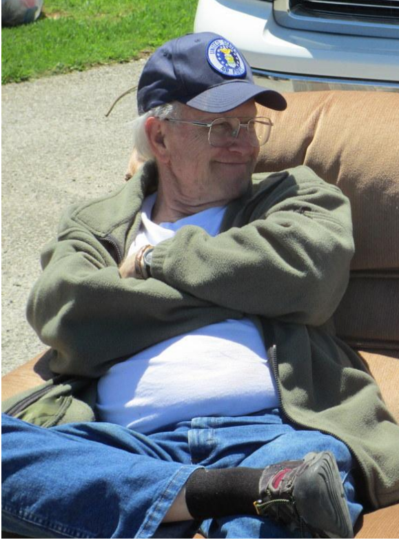
Second Vice Commander busy testing a sofa for quality and comfort.