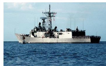
USS Stark (FFG-31)

The documents stated: “With obsolete combat systems and aging hulls, these vessels would require significant upgrades to remain warfighting relevant for another decade. Any potential return-on-investment would be